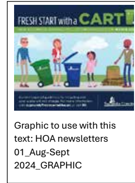
Graphic to use with this text: HOA newsletters 01_Aug-Sept 2024_GRAPHIC

*Sample garbage carts will be on display throughout Sarasota County during the cart selection window.